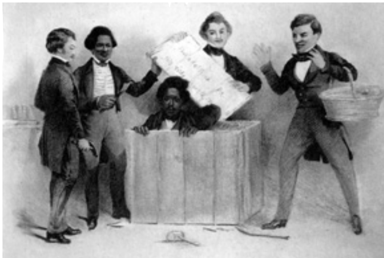
The escape of a slave from Richmond, Virginia to Philadelphia in the North.